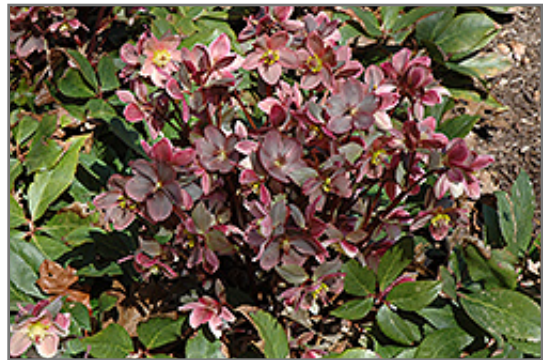
Pink Frost Hellebore in bloom