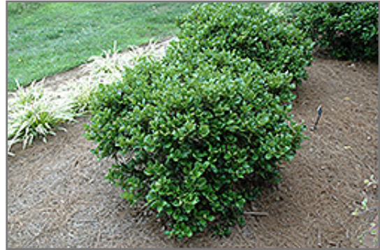
Carissa Holly

Carissa Holly is recommended for the following landscape applications;