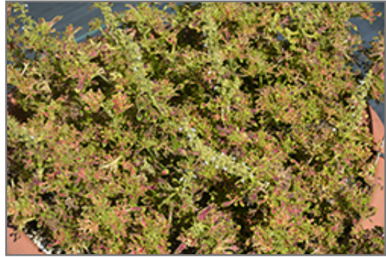
Under The Sea Red Coral Coleus foliage

Under The Sea Red Coral Coleus will grow to be about 20 inches tall at maturity, with a spread of 24 inches. When grown in masses or used as a bedding plant, individual plants should be spaced approximately 20 inches apart. Although it's not a true annual, this fast-growing plant can be expected to behave as an annual in our climate if left outdoors over the winter, usually needing replacement the following year. As such, gardeners should take into consideration that it will perform differently than it would in its native habitat.