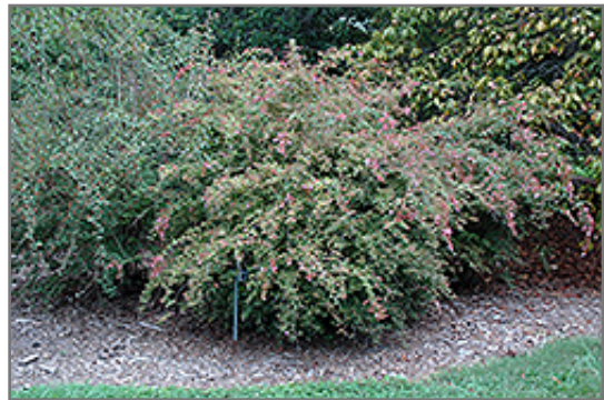
Edward Goucher Abelia in bloom