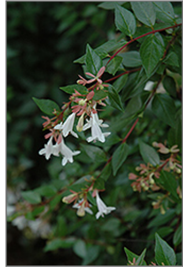
Edward Goucher Abelia flowers

Edward Goucher Abelia is recommended for the following landscape applications;